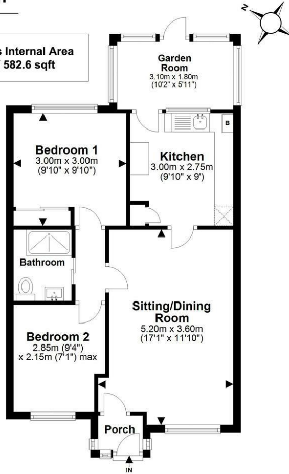
Illustration for identification purposes only; measurements are approximate, not to scale. www.fpusketch.co.uk Plan produced using PlanUp.

Approx Gross Internal Area 54.1 sqm / 582.6 sqft